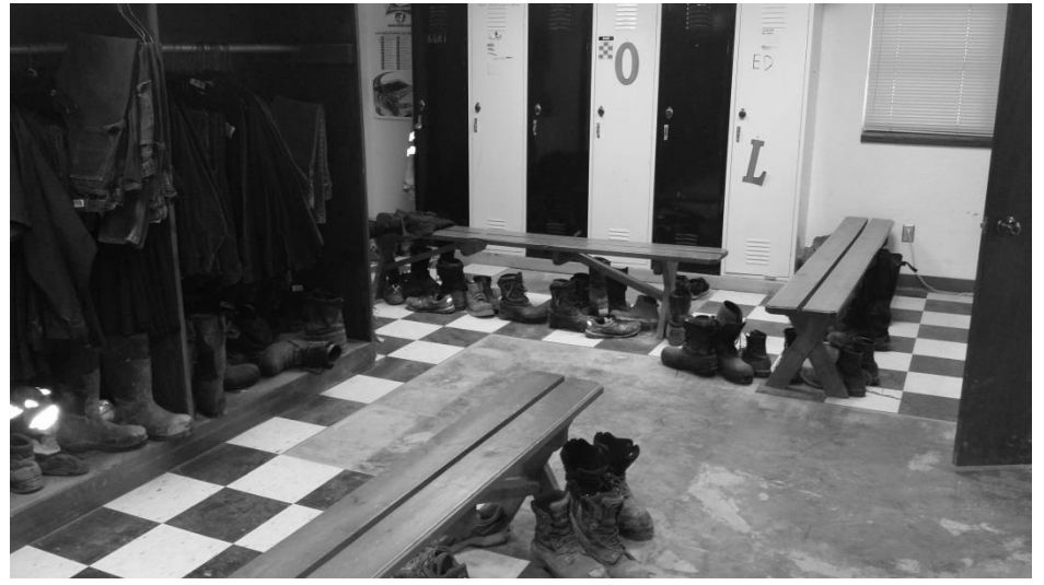
Locker Room: East Side