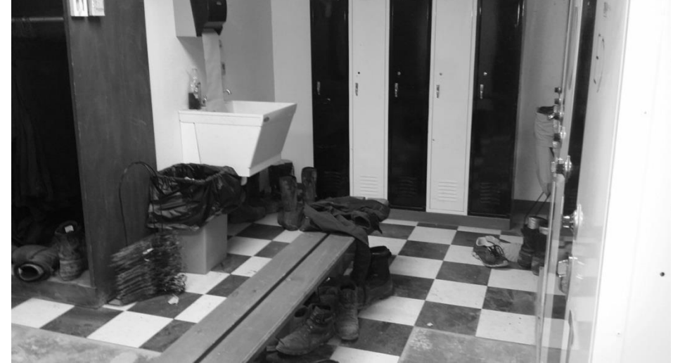
Locker Room: Northeast Corner