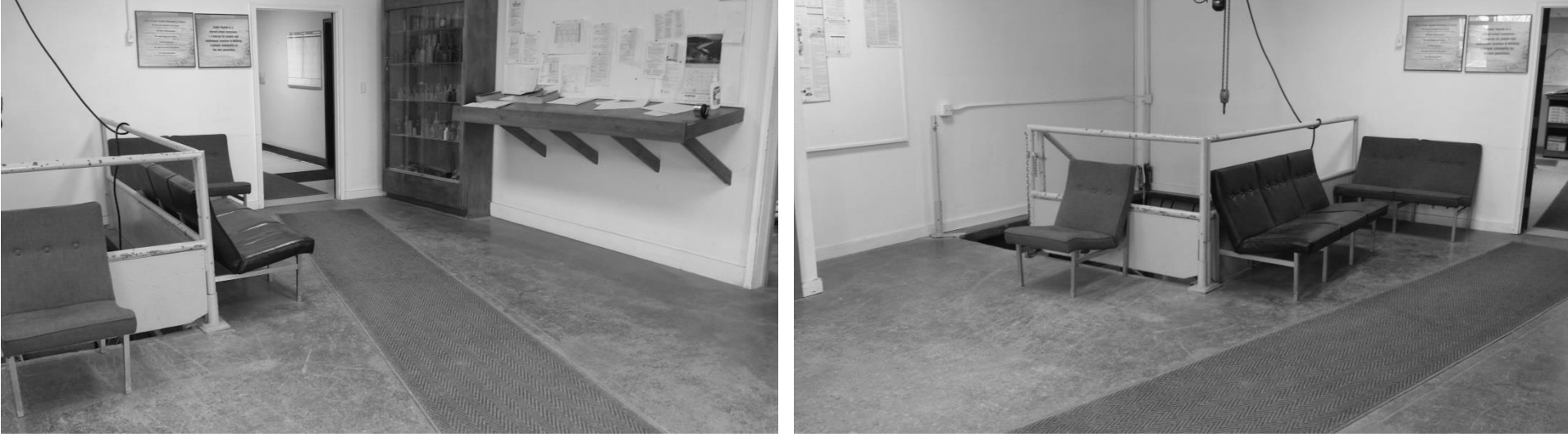
Lobby: Northwest Corner