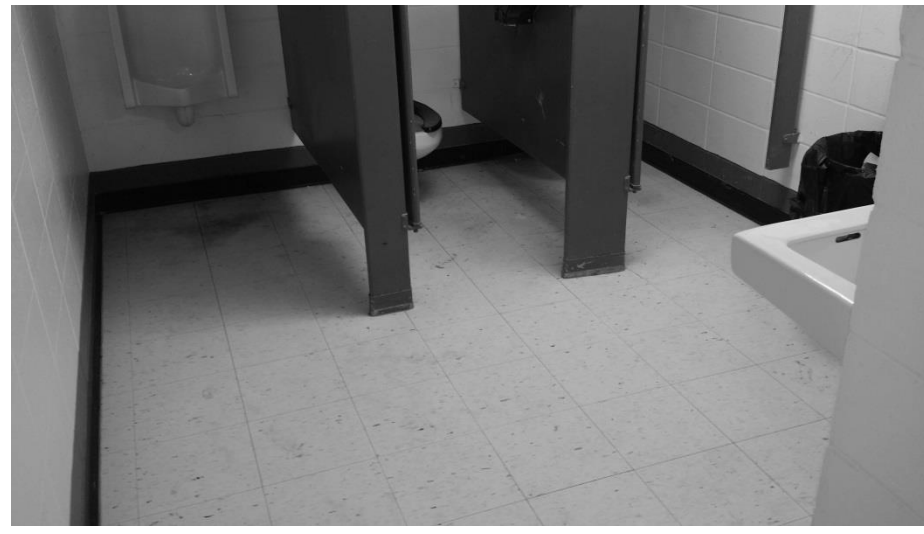
Bathroom: West Side