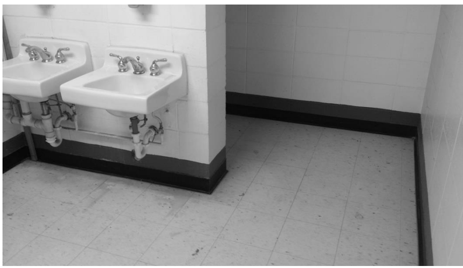
Bathroom: East Side