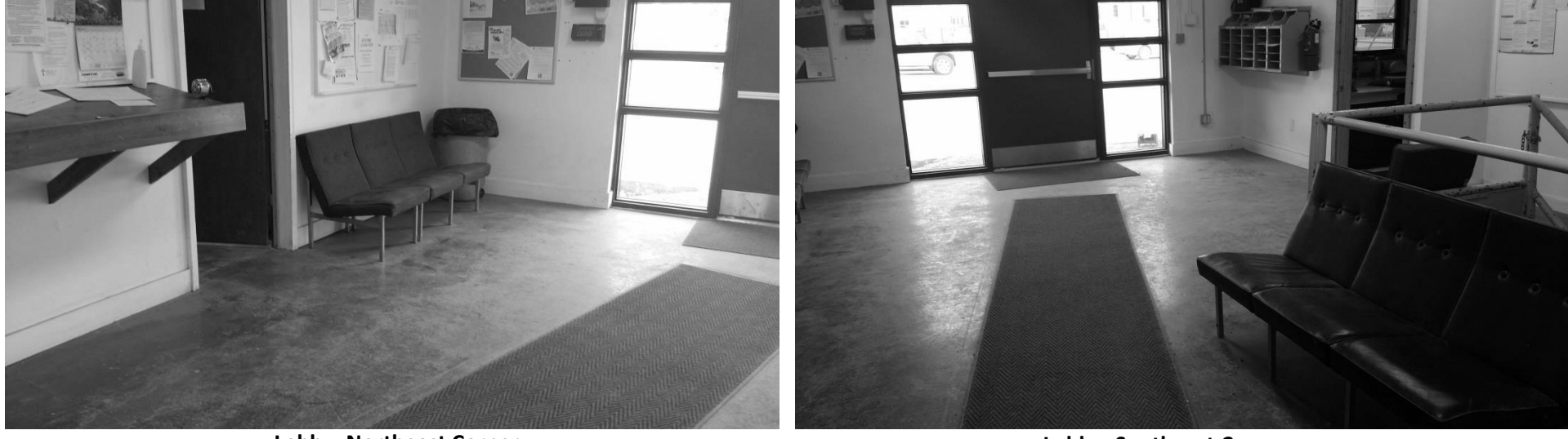
Lobby: Northeast Corner