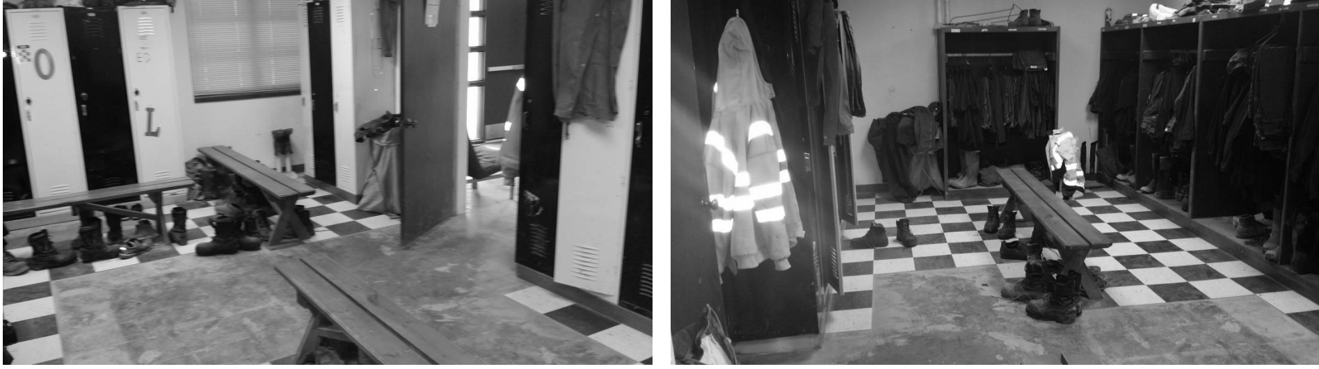
Locker Room: Southeast Corner